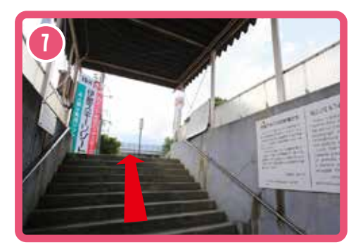
Walk up the stairs.