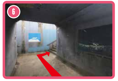
Turn right at the end of the underground passageway