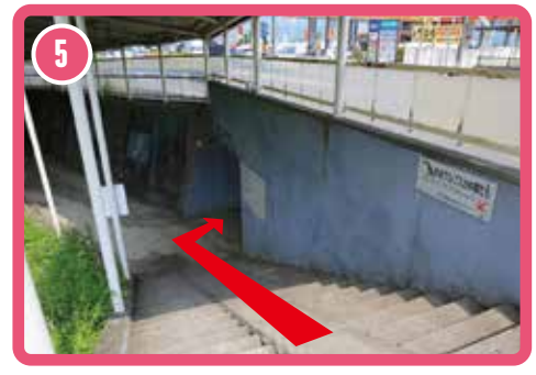
Walk down the stairs and turn right for the underground passageway.