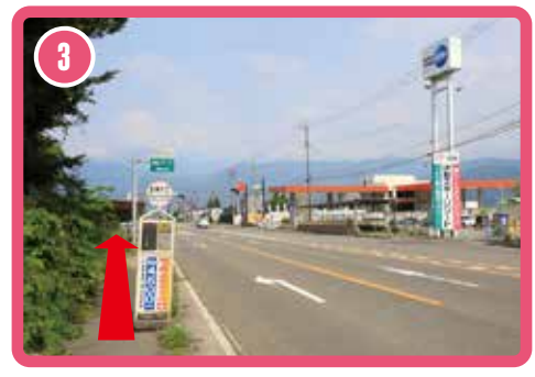
Turn left and head east (toward the Komagane Interchange)