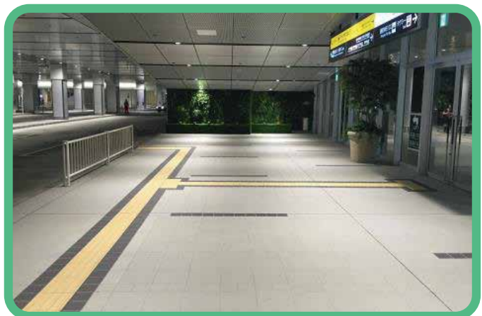
2 Arrive at the Shinjuku Bus Terminal expressway bus stop. (third floor)