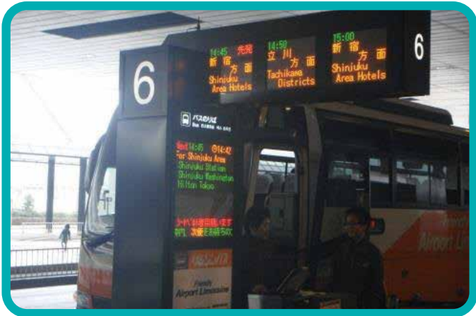
1 Terminal 2 Zone B bus area.