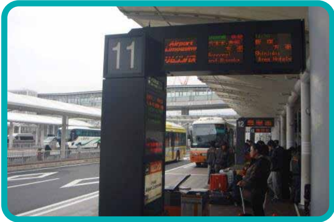
1 Terminal 1 South Wing bus area.