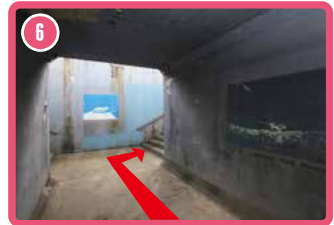
6 Turn right at the end of the underground passageway