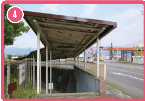
4 Use the underground passageway to cross the street.