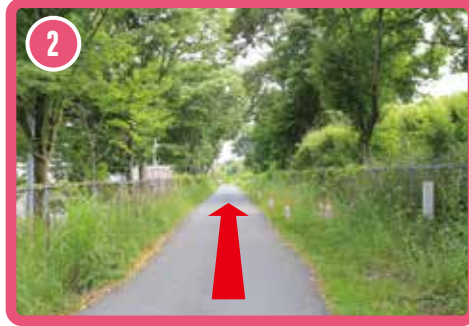
2 Walk along the path located to the west. This will take you to a large street.