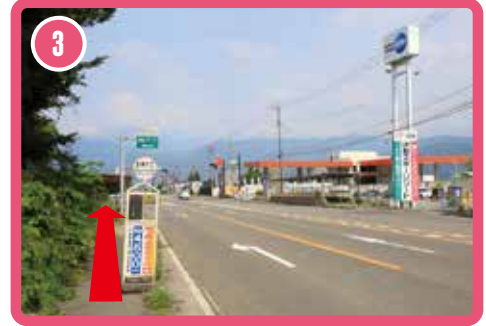
3 Turn left and head east (toward the Komagane Interchange)