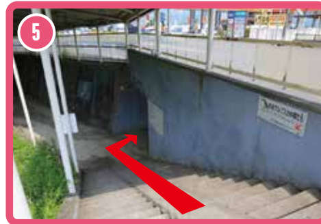
5 Walk down the stairs and turn right for the underground passageway.