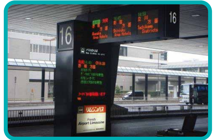
1 Terminal 2 Zone A bus area.