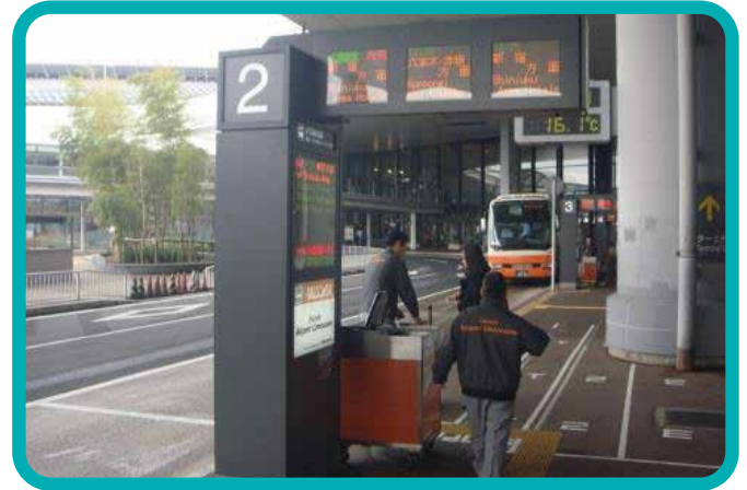
1 Terminal 1 North Wing bus area.