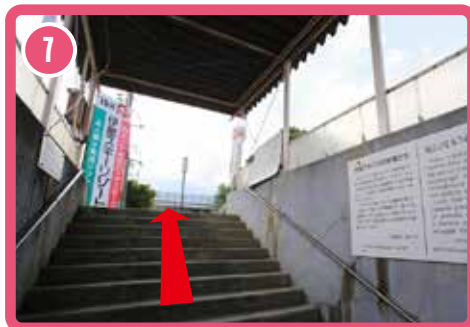
7 Walk up the stairs.