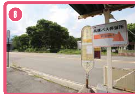
8 The Nyotai-Iriguchi Bus Stop is located immediately after emerging from the underground passageway. Take the Route bus from this stop to the ropeway.