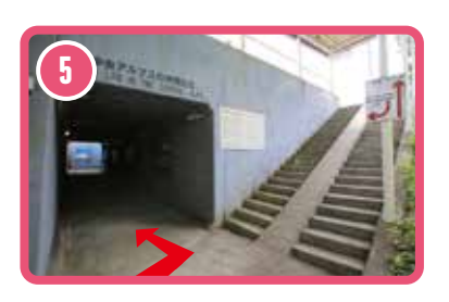
Turn left and walk through the underground passageway.