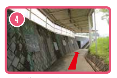
Keep walking straight.