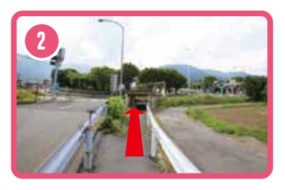
Walk along the path located to the west (toward the Komagane Interchange).