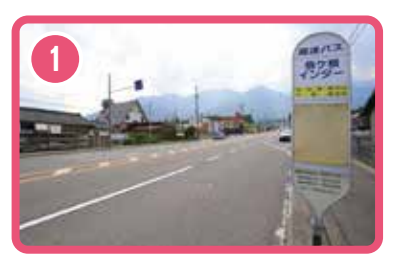
Photo of the Komagane Interchange Expressway Bus Stop. You will need to use a different bus stop for your return trip.