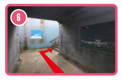
Turn right at the end of the underground passageway.