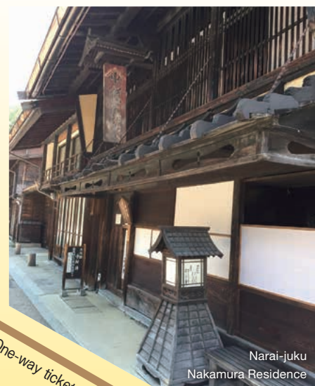
Narai-juku Nakamura Residence