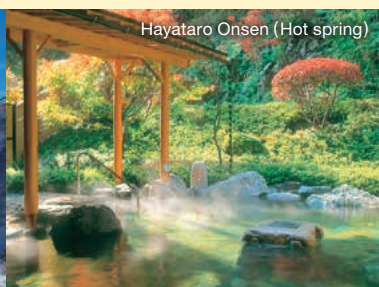
Hayataro Onsen (Hot spring)