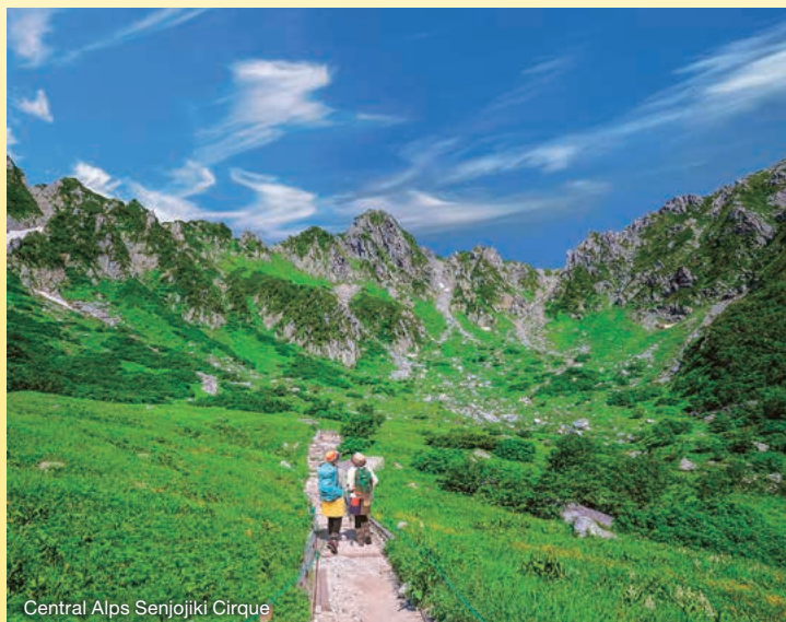
Central Alps Senjojiki Cirque

Depart and arrive at Shinjuku 31,580 yen for 2 persons